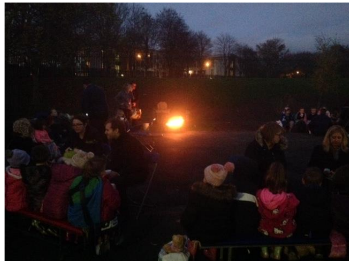
Tales around the campfire

Dear Parents, Carers and Governors, It has continued to be a very busy term!