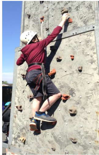
Arthog Outreach Base 8